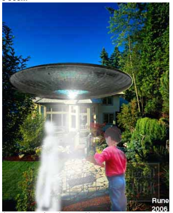
this picture not from the original book

cape, because there were no arms or legs to be seen.